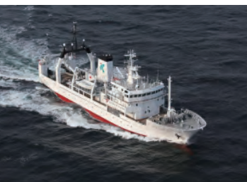
* Kagoshima University training vessel “Kagoshima-Maru”

is difficult to separate these floating marine debris between Tsunami debris and general marine debris, because both are mainly the same plastic and general items. We are worried that the increasing plastic in the ocean would increase the number of accident by plastic. Of course, this tuna was deliciously eaten by us.