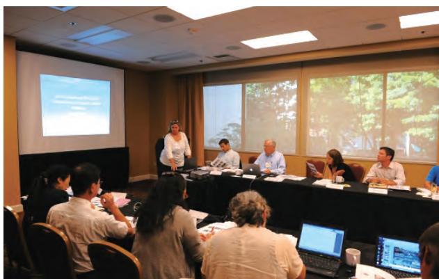
* The Hawaii State ICC coordinator's presentation.