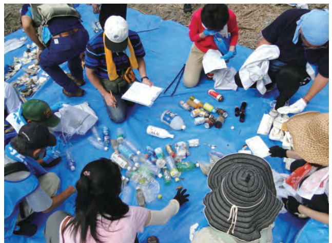
* 71 people participated for the ICC survey. We retrieved 68 30-liter bags of trash totaling 220kg, including many plastic beverage bottles (PET bottles).

After closing the summit, we also conducted wrap up lessons at four municipal elementary schools, which also participated in the preliminary event. It seemed to be a good opportunity to learn about the problem of marine litter afresh, through the trash entanglement simulation experience and by hands-on experience on a real and interesting driftage other than trash.