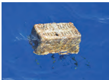
* Drifting marine debris with gathering fishes