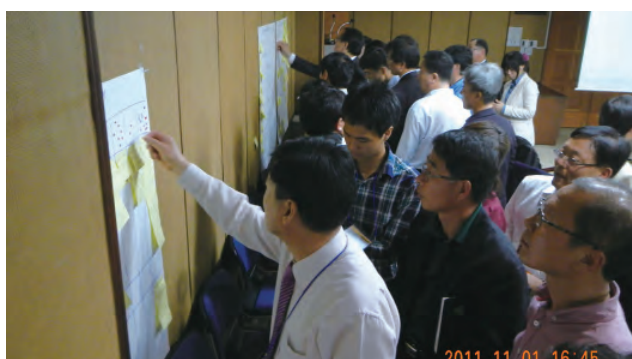
* At the workshop in 2011, the participants polled with marks for the best policy measures.

OSEAN began to find the stakeholders of the EPS float issues in 2009. The Korea Foam-Styrene Recycling Association ( http://www.eps.or.kr/ ) agreed with us that EPS debris is a serious problem. From 2010, the Association has been financially supporting OSEAN to hold the workshop on EPS debris and recycling every year.