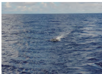
* Sampling the small plastic debris by a neuston net