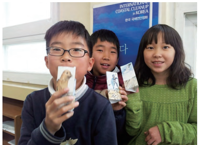
* Students using the activity book at school (Dec. 21, 2012)