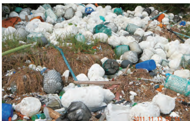
* The EPS float debris in a Korean island

OSEAN (Our Sea of East Asia Network), an NGO in Korea, has devoted itself to solving the Styrofoam debris problem from its establishment in 2009. Here is the procedure of three-year activities on solving the problem. The result of the workshop on EPS float held on October 25, 2012 in Geoje Island in Korea is summarized.