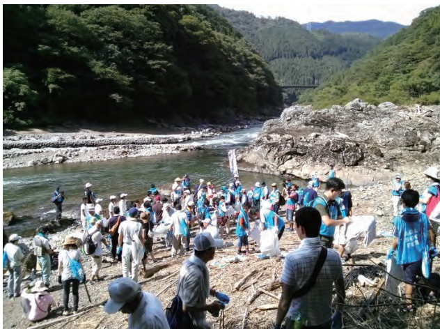
* A scene at Canon Beach--Local people were quite surprised with group including foreigners who were followed by many media crews with cameras and microphones.