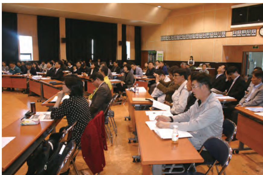
* About 90 stakeholders participated to the workshop in 2012

We are planning to make a full-length report on the result of the workshop. From the report, the best policy measures on EPS float will be developed. We will spread the report to the participants and to the policy decision makers so that they can use the information. We will continue our activities until the EPS float marine debris problem is solved clearly.