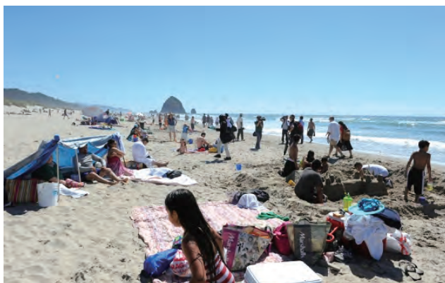
* A scene at Canon Beach—Local people were quite surprised with group including foreigners who were followed by many media crews with cameras and microphones.

Coincidentally, during our visit, there will be a community cleanup at Kamilo Point, a ragged beach on Hawaii Island, so we will arrange our schedule to join the cleanup. Kamilo is known as a beach that attracts much marine litter because of its geographical location. We are wondering if we will find any objects washed ashore from the tsunami after the earthquake; and if we do, what kinds of items will they be?