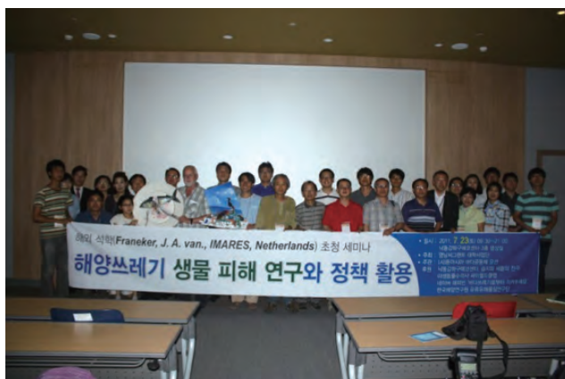
* The seminar was held in Busan in 2011 with the financial support from Young Nam Sea Grant.

We have summarized the cases in various viewpoints, and analyzed them. For example, leisure fishing explained more than 70% of the cases, which means we need to make effort to reduce marine debris from leisure fishing. As we thought we need to share the research process and result with more people, we published a book and a scientific journal paper. The pdf file of the book can be downloaded from our website. The scientific journal paper (hong et al., 2012) can be purchased from the journal website.