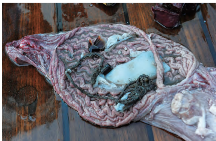
* A plastic pipe and a rope found from a tuna stomach (Aug.28 2012, 32.2°N, 161°W)