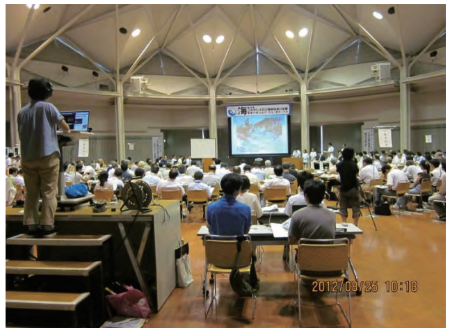
* Integral discussion program on Aug. 25, 2012